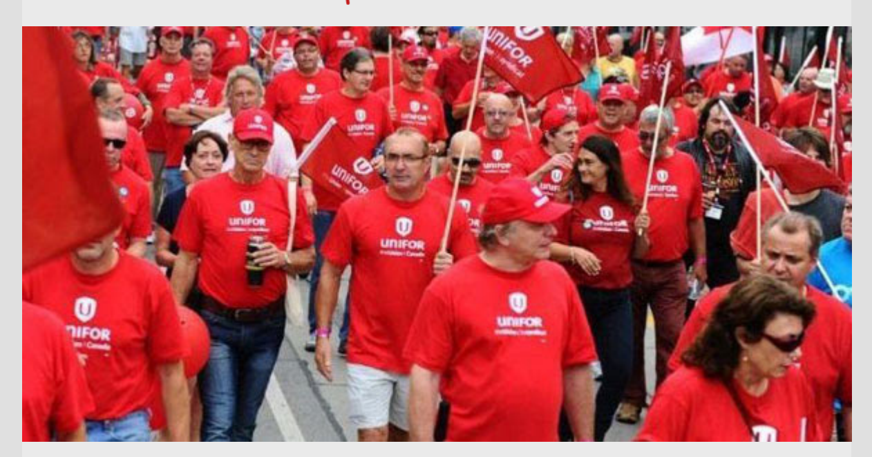
Bell Canada lays off 76 technicians, and plans to outsource work for new high-speed internet program.