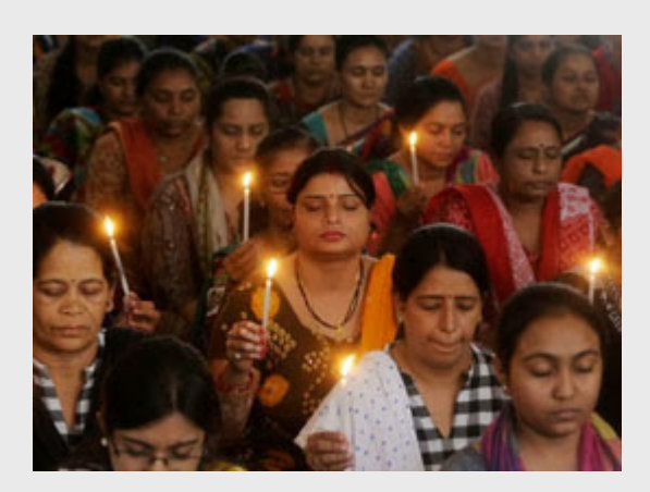
Unifor condemns attacks in Sri Lanka and calls for compassion and acceptance to combat threats to religious freedom.